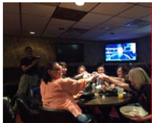
More Chapter Chase fun!