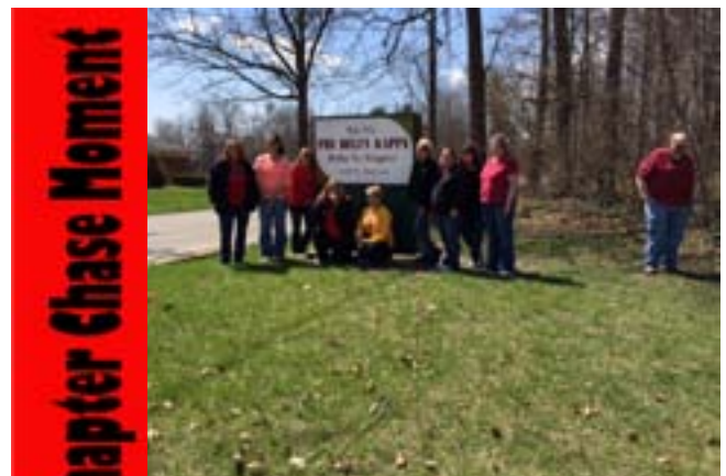
PDK Sweethearts at the Delta Nu Chapter House on the Chapter Chase